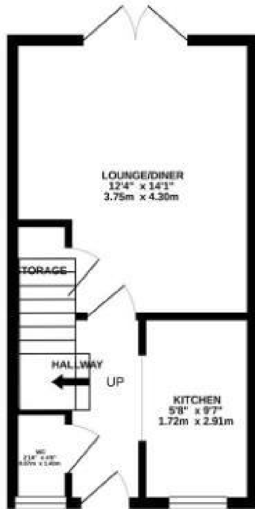
1ST FLOOR 291 sq.ft. (27.0 sq.m.) approx.